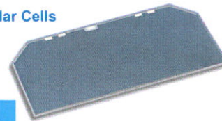
Space Solar Cells