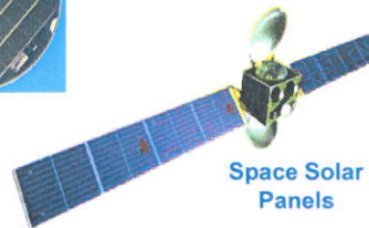
Space Solar Panels